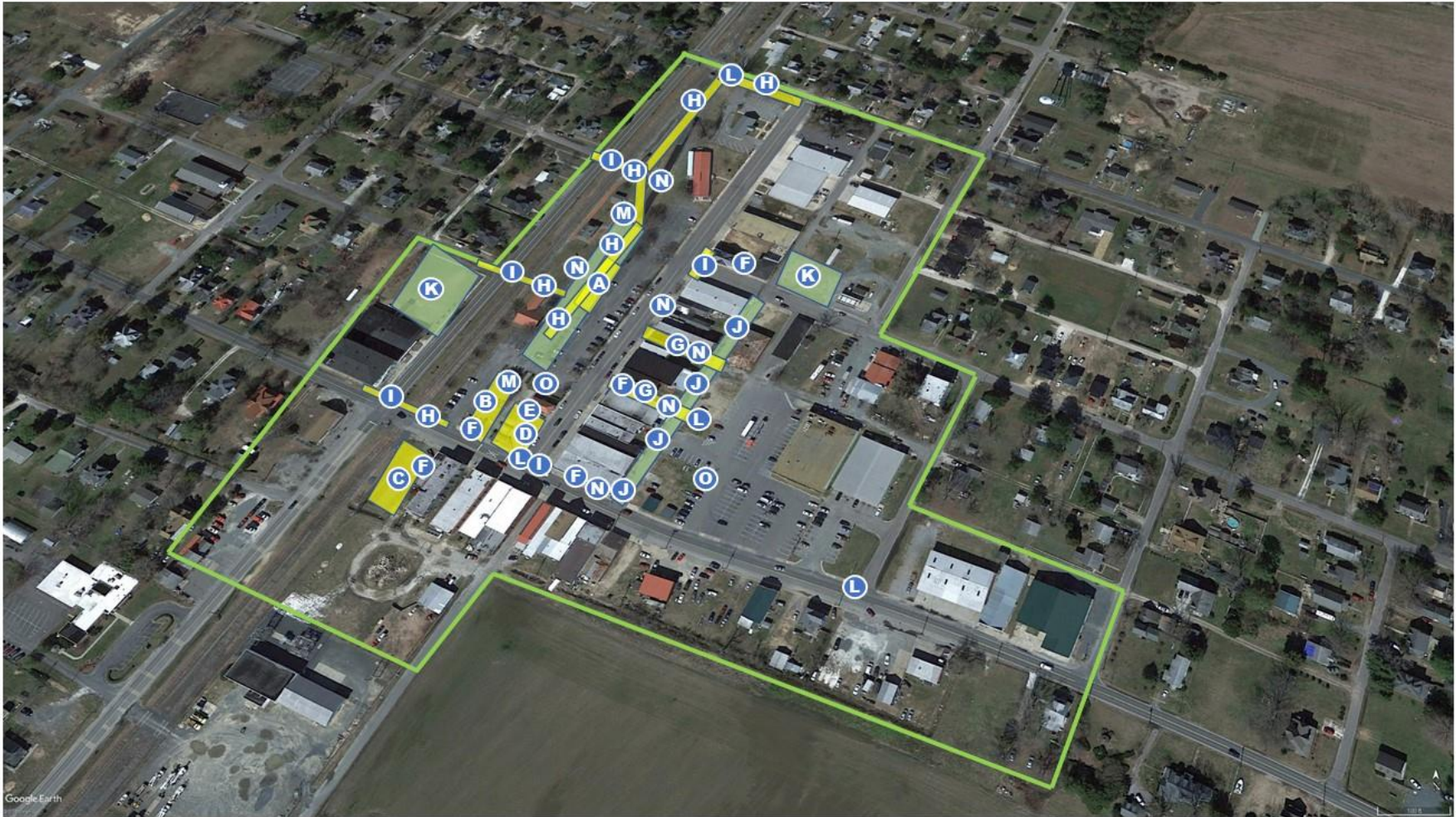
Figure 1 – Preliminary Conceptual Projects for Entire Downtown Parksley Area