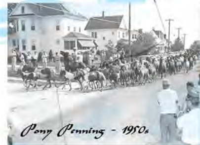
Pony Penning - 1950s