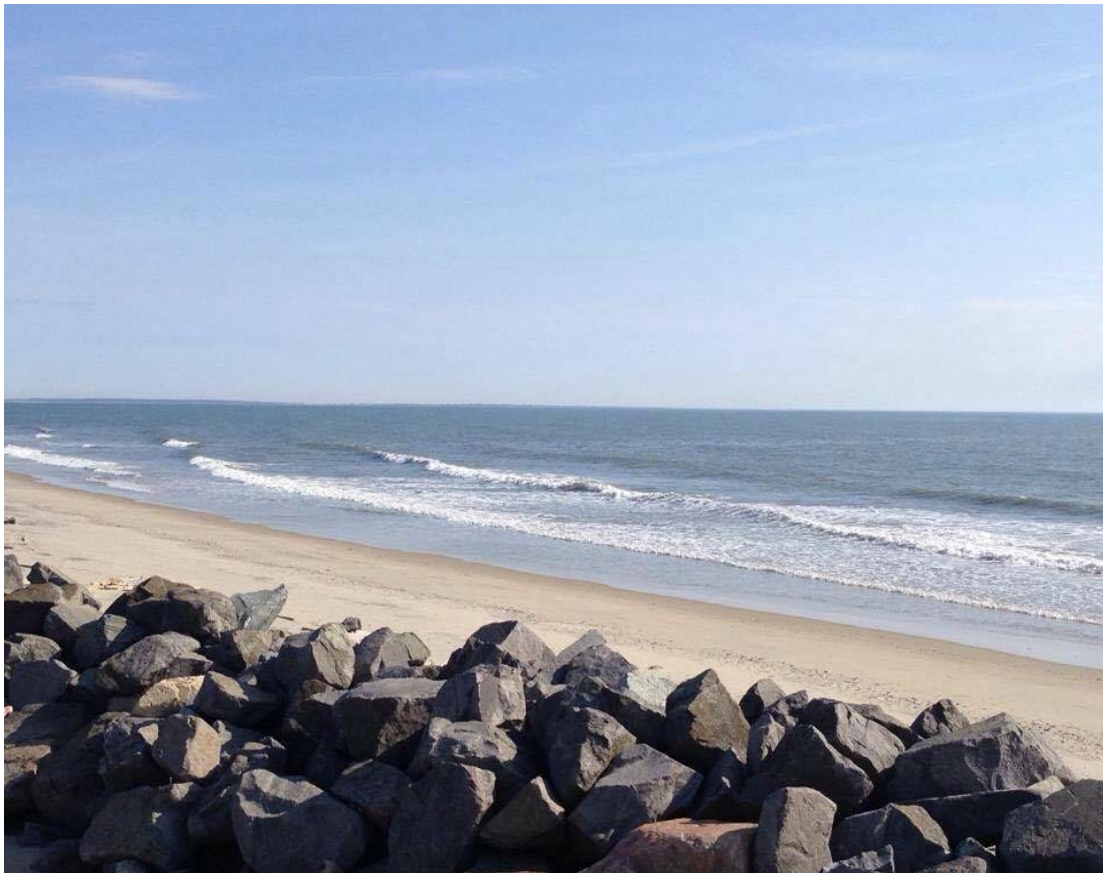
Figure 7: Revetment at the beach of Wallops Flight Facility.

Revetments tend to reflect less wave energy because they are more sloped but are still subject to the same erosion impacts as other parallel structures. Accessibility to the shoreline can be a drawback of using revetments (USACE, 2015).