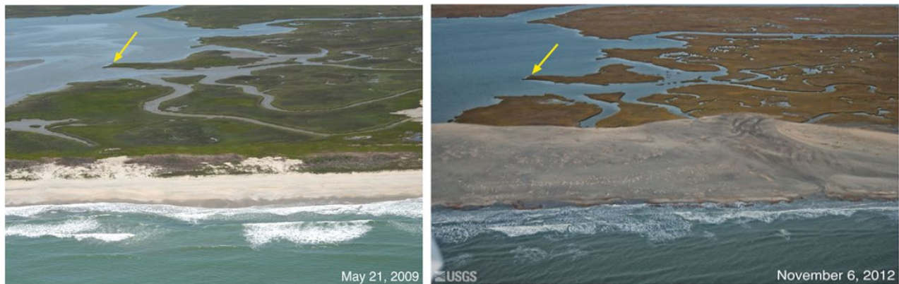
Figure 5: Aerial photographs of a section of Assateague Island before and after Hurricane Sandy.

Because the Eastern Shore barrier islands are largely in their natural states and without erosion control mechanisms, the process of rollover is readily observed. In Figure 5, images of a section of Assateague Island, taken before and after Hurricane Sandy, illustrate how waves washing over the island carried sand toward the mainland. This phenomenon provides critical width for islands and establishes a back-barrier platform which the island can continue to roll onto, thereby increasing the long-term viability of the island.