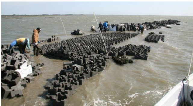
Figure 11: Oyster Reef under Construction Photo Credit: © Bowdoin Lusk/ The Nature Conservancy. Used with permission.