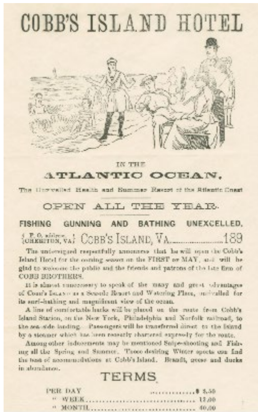
Figure 1: Advertisement for Cobb Island Hotel

Standing on the pristine beach of Cobb Island in Northampton County, one would never know that the now-tranquil barrier island was a bustling recreational center in its prime where a harpist once entertained guests in the island's grand resort hotel (Figure 1: Advertisement for Cobb's Island Hotel).