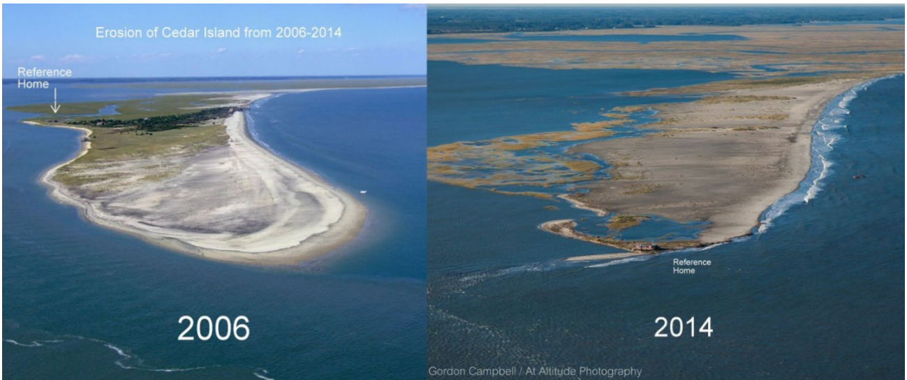
Figure 4: Changes to the southern end of Cedar Island, 2006-2014.

Because the Eastern Shore barrier islands are largely in their natural states and without erosion control mechanisms, the process of rollover is readily observed. In Figure 5, images of a section of Assateague Island, taken before and after Hurricane Sandy, illustrate how waves washing over the island carried sand toward the mainland. This phenomenon provides critical width for islands and establishes a back-barrier platform which the island can continue to roll onto, thereby increasing the long-term viability of the island.