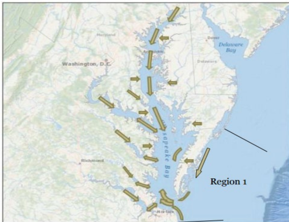
Figure 2: Net sediment transport pathways for Chesapeake Bay and Atlantic area off the Virginia Coast.

With perpendicular or near-perpendicular waves, sand is pushed onto the beach by breaking waves, and pulled back as the wave washes back into the ocean. Longshore drift is a phenomenon created by waves striking the shore at an angle and water being pulled back into the ocean perpendicular to the shore. This drift generally moves sand southward along the Atlantic coast of the Eastern Shore (Hyndman and Hyndman, 2011). This pattern moves sediment grain-by-grain to build long stretches of beach, a pattern that is repeated within zones along the entire Atlantic coastline. The general pattern of transport in the Eastern Shore area is southward along the Atlantic Coastline into the Chesapeake, and southward within the bay to the lower Chesapeake where it is deposited either in the bay or tributaries of lower bay rivers, as shown in Figure 2 (USACE, 2015).