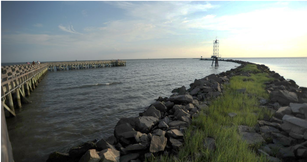
Figure 6: Jetty at Cape Charles Harbor. Photo Credit: Jay Diem, Eastern Shore News. Used with permission.

Groins and jetties interrupt the natural drift of sand, causing sediment to build, or accrete, on the up-drift side of the structures. These structures accelerate erosion on the immediate down-drift side because the area is robbed of the natural sediment it would have received from longshore drift (Barnard, T., VIMS Self-Taught Education Unit, Coastal Shoreline Defense Structures). The VIMS Self-Taught unit on Coastal Shoreline Defense Structures contains additional information on groins and jetties.