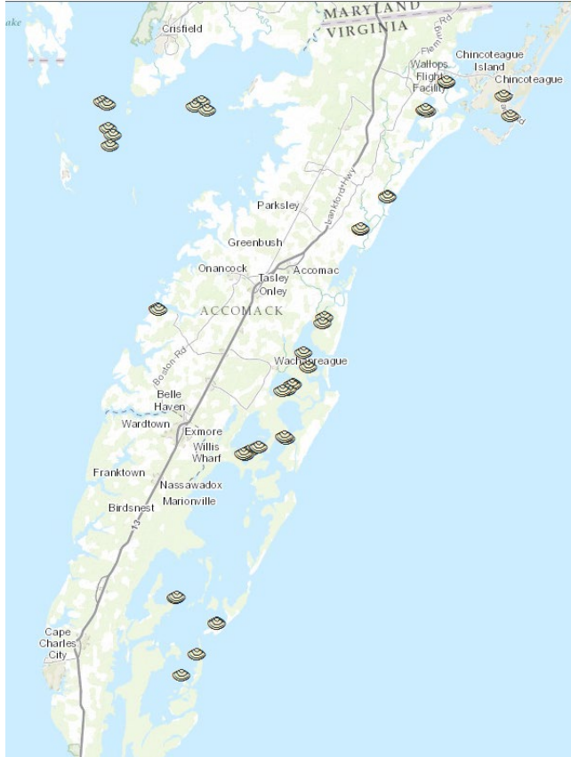
Figure 10: Locations of Manually-Constructed Oyster Reefs in Waters off Virginia's Eastern Shore.