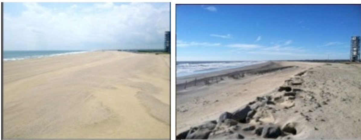
Figure 9: Beach Erosion at Wallops Flight Facility. Left: The completed beach nourishment project at WFF in August 2012. Right: The same stretch of beach is extensively eroded less than three months later, following Hurricane Sandy.

In February 2020, the U.S. Army Corps of Engineers awarded a $23.7 million contract to a Florida-based company to conduct beach renourishment at Wallops Island, including “construction of breakwaters and placing 1.3 million cubic yards of sand along a four-mile stretch of the facility’s waterfront.” (US Army Corps of Engineers, Norfolk District Website, 2020).